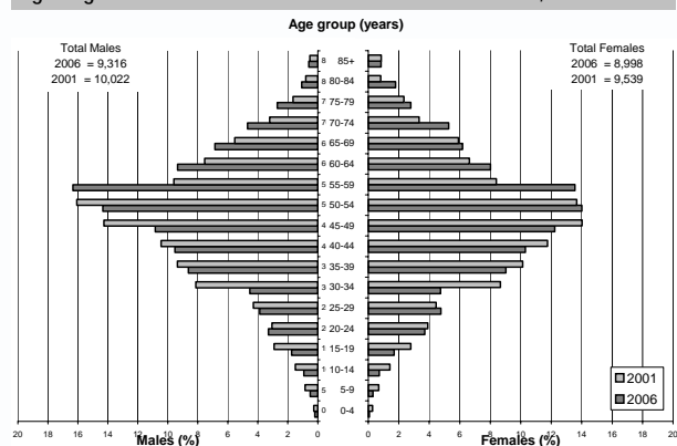
Fig 2: Age and Gender Distribution of FYR Macedonia-Born, 2006