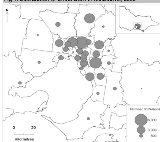
Fig 1: Distribution of China-Born in Melbourne, 2006

1 Respondents had the option of nominating several ancestries, but only the first two responses were processed in the Census.